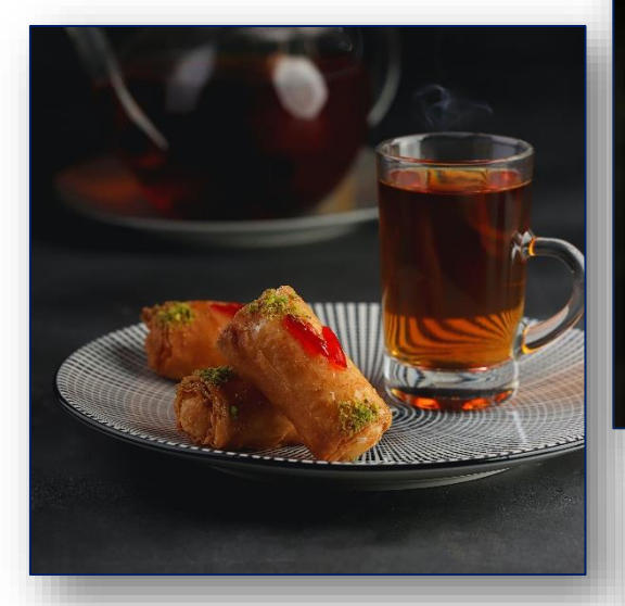
OUR Truth Culture Religion Social Norms